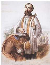
-St. Francis Xavier

“No one can ever excel in great things who does not first excel in small things.”