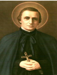
-St. Peter Chanel, Priest & Martyr

“Kindness is the language that the deaf can hear and the blind can see.”