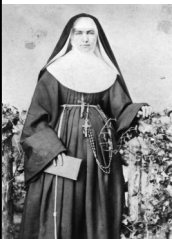
-St. Marianne Cope

"I do not think of reward. I am working for God and do so cheerfully."